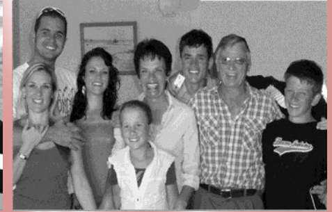
The Grobler Extended Family